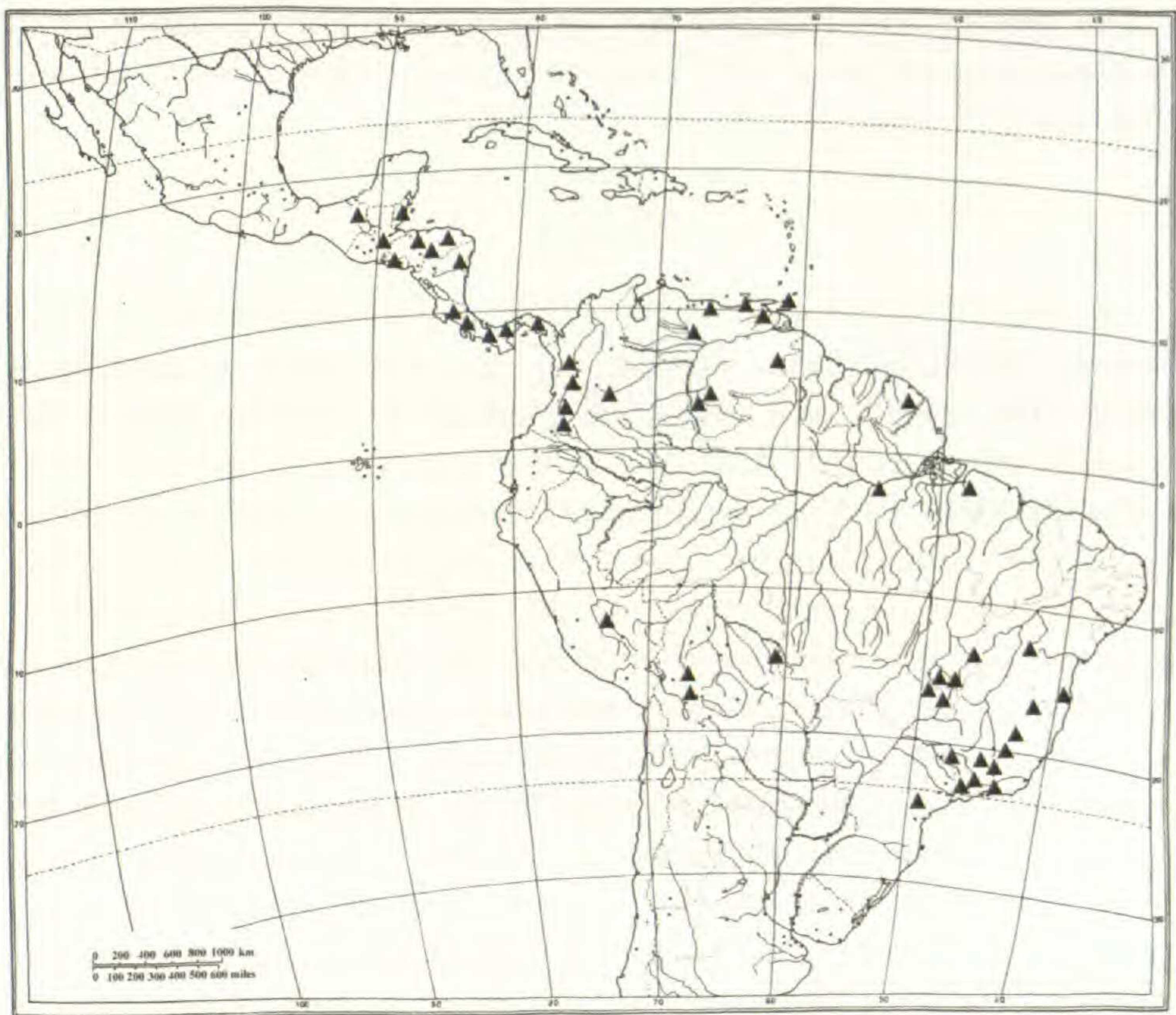
Figure 1. Distribution of Paspalum pilosum .

to field observations made by Dr. O. Morrone (pers. comm.), led us to consider P. peregrinum as a doubtful species, similar to P. pilosum . A detailed morphologic study of both species was performed in order to analyze diagnostic characters and to recircumscribe both species.